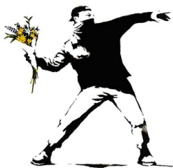
Society as change (above: Banksy)...

Department of Sociology and Social Work University of Wisconsin-Stevens Point